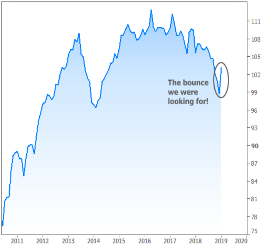
Pending Home Sales

Unfortunately, we also saw the beginning of a fairly abrupt move higher in rates on Wednesday. Early that morning, underlying bond markets (which dictate mortgage rates) began to look panicked. It wasn't immediately clear what caused the move although Brexit-related news was the leading